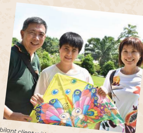
Jubilant client with her parents after some fun kite flying time.