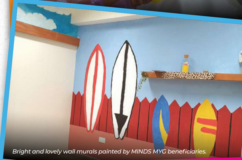
Bright and lovely wall murals painted by MINDS MYG beneficiaries.