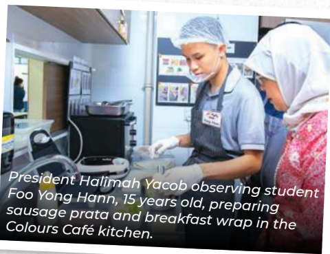
President Halimah Yacob observing student Foo Yong Hann, 15 years old, preparing sausage prata and breakfast wrap in the Colours Café kitchen.