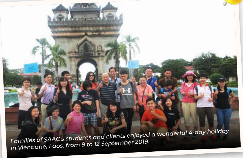
Families of SAAC's students and clients enjoyed a wonderful 4-day holiday in Vientiane, Laos, from 9 to 12 September 2019.

The trip in September this year saw a total of 22 participants from five families bonding over good food and beautiful natural sights in Vientiane, Laos, with a key highlight being a cross-cultural exchange with Vientiane Autism Center. Families and staff from Singapore spent a fun-filled day of meaningful engagement with many Laotian families.