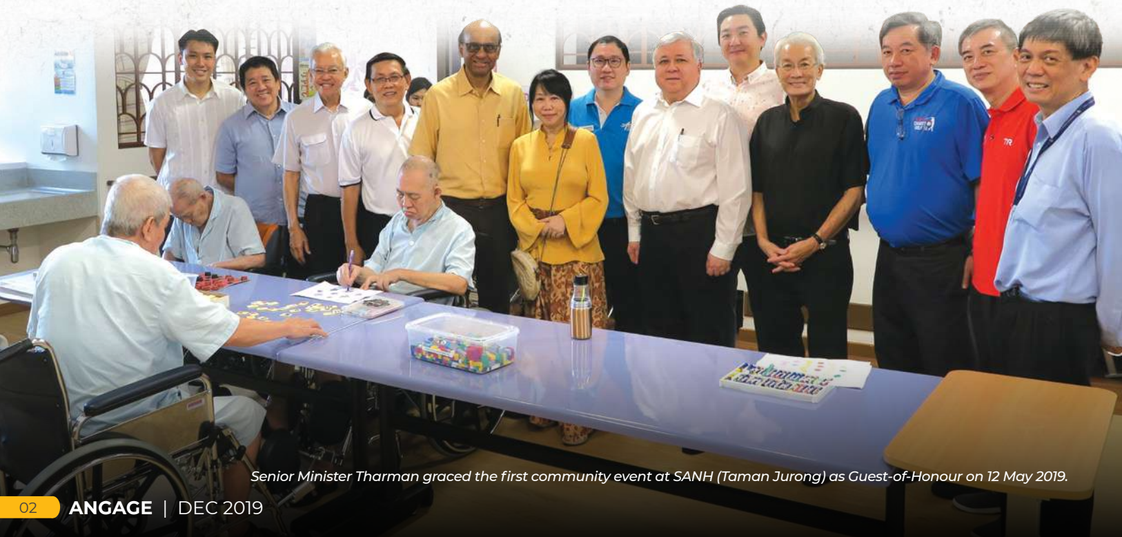
Senior Minister Tharman graced the first community event at SANH (Taman Jurong) as Guest-of-Honour on 12 May 2019.