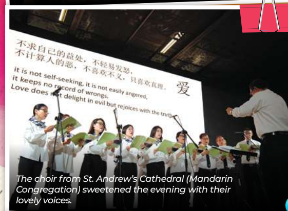
The choir from St. Andrew's Cathedral (Mandarin Congregation) sweetened the evening with their lovely voices.