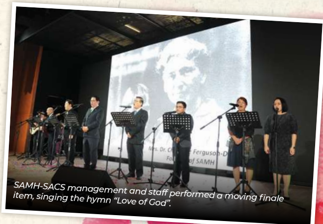
SAMH-SACS management and staff performed a moving finale item, singing the hymn "Love of God".

As we look forward to our upcoming chapters, we seek to embrace the challenges that lie ahead, knowing that the work we do is anchored in the Agape love of God – a Love that never Fails.