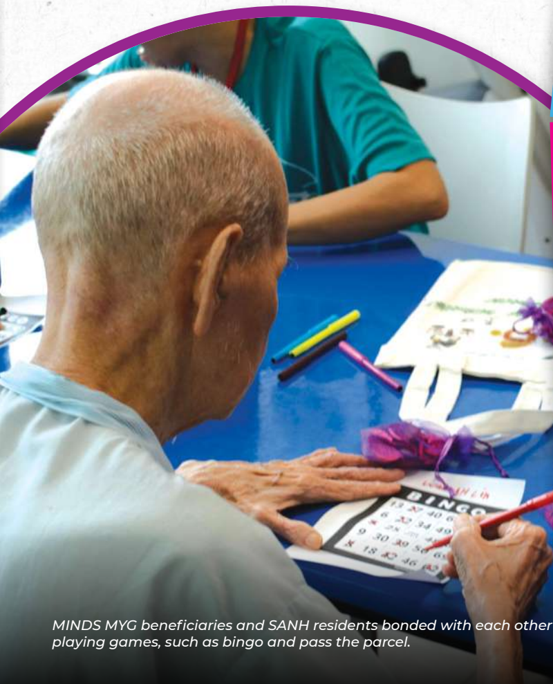
MINDS MYG beneficiaries and SANH residents bonded with each other while playing games, such as bingo and pass the parcel.

SANH (Queenstown) is indeed blessed to have the support of our community and looks forward to more of such opportunities where residents and community partners can spend meaningful time together!