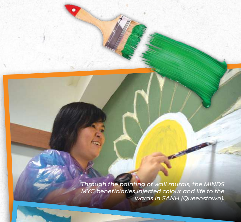
Through the painting of wall murals, the MINDS MYG beneficiaries injected colour and life to the wards in SANH (Queenstown).