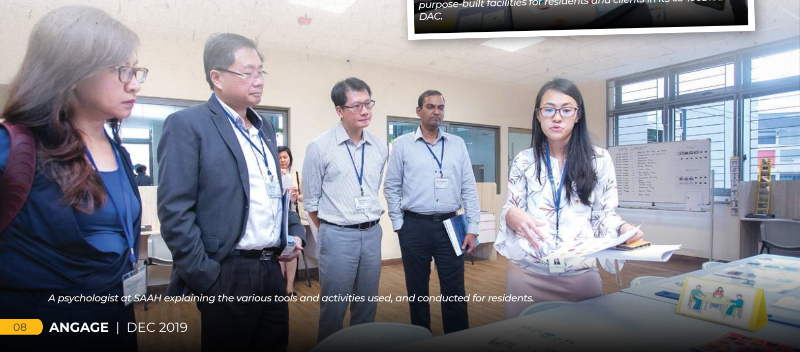
A psychologist at SAAH explaining the various tools and activities used, and conducted for residents.