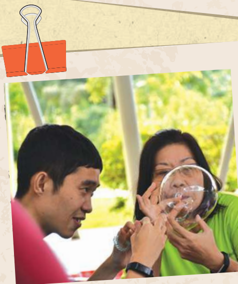
DAC client having fun with his mother, blowing plastic bubbles.