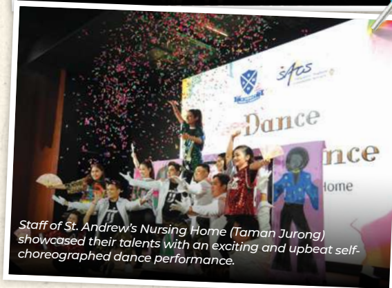
Staff of St. Andrew's Nursing Home (Taman Jurong) showcased their talents with an exciting and upbeat self-choreographed dance performance.