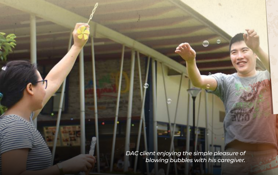
DAC client enjoying the simple pleasure of blowing bubbles with his caregiver.