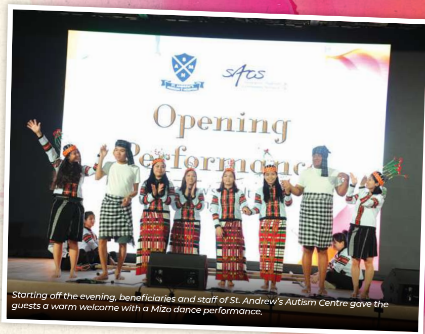
Starting off the evening, beneficiaries and staff of St. Andrew's Autism Centre gave the guests a warm welcome with a Mizo dance performance.