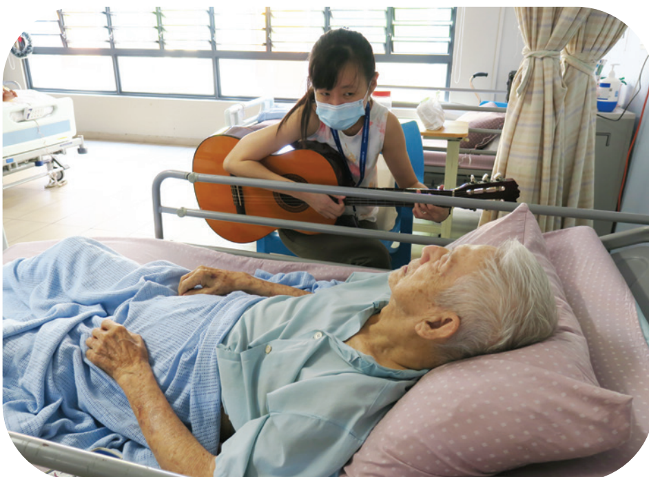
An individual music therapy session focusing on validating one's sense of identity and well-being through music engagement and music-based reminiscence.

"My best companion during the visitation restrictions was a radio gifted to me. I enjoyed different types of music played on various radio channels. I am looking forward to having volunteers visit us again so that we can enjoy sing-along sessions with them as well as live music entertainment."