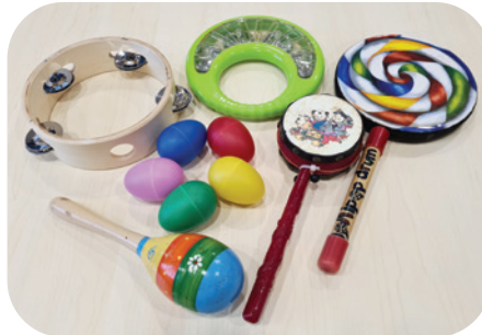
A wide variety of instruments are provided to suit different physical capabilities as well as create interest and excitement for active participation.

With these desired outcomes in mind, all our nursing homes under the umbrella of St. Andrew's Mission Hospital and Singapore Anglican Community Services initiated music-related programmes, in the form of music therapy and recreational programmes such as sing-alongs, karaoke sessions, ukulele appreciation and music jamming sessions with percussion instruments.