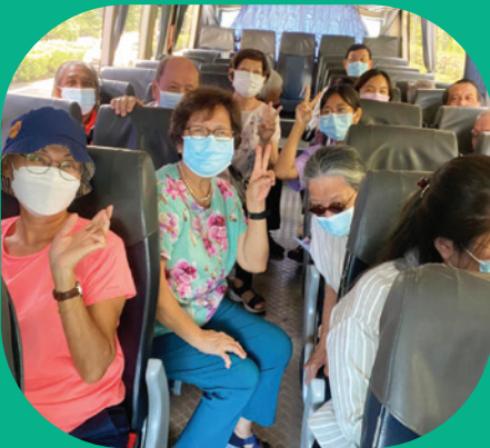
Residents and volunteers posed for a picture before they embarked on their trip.

On July 2022, with the easing of Safe Management Measures, our residents were thrilled to embark on their first outing to Dignity Kitchen after a long hiatus since the Coronavirus Disease [COVID-19] pandemic hit the world. Dignity Kitchen is a social enterprise kitchen that provides employment to the disadvantaged and persons with special needs.