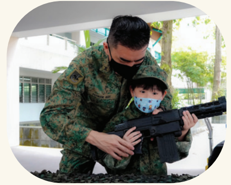
Total Defence Day at St. Andrew's Mission School!

The first half of 2022 had been nothing short of amazing for everyone at St. Andrew's Mission School [SAMS]. Team SAMS witnessed God's goodness at work as we co-shaped the school with our students and their parents.