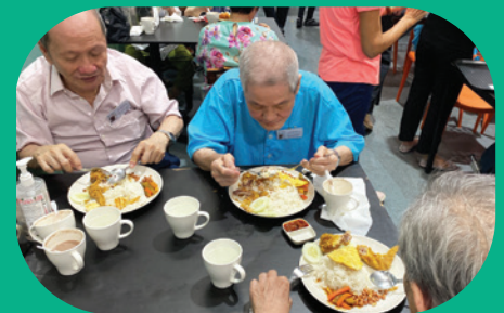
Residents enjoyed their sumptuous lunch.

The hospitality continued as our residents enjoyed a sponsored sumptuous lunch of local hawker delights.