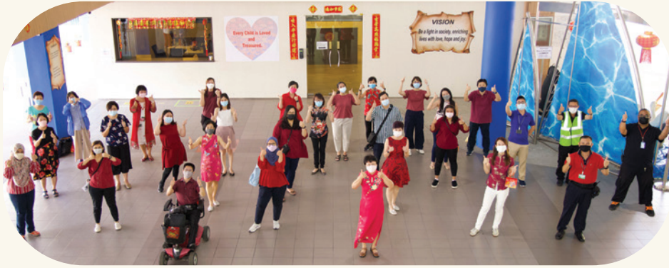
St. Andrew's Mission School team at its First Lunar New Year Celebration!