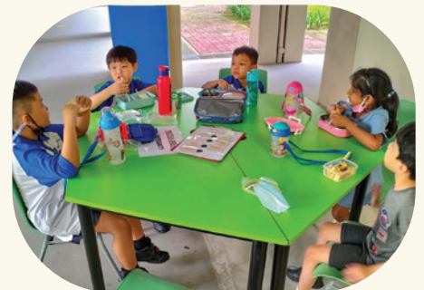
Students enjoyed their recess on their first day of school.

Assembly as well as First Lunar New Year, Hari Raya Puasa and Total Defence Day Celebrations. As we forge ahead, we pray for His continued guidance in weaving together a strong network of support for our students with their parents and our strategic partners.