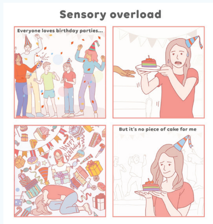
A comic illustrating sensory overload that persons on the autism spectrum may experience was featured as part of the "This Is Me" campaign.

Five graphic stories to illustrate the different ways in which persons on the autism spectrum may perceive the world around them through comics were also produced as part of the campaign.