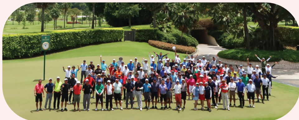
Before the tee-off! 128 golfers stood together in solidarity in support of the work we do at SACH.

We are grateful for the support of all our donors and sponsors who collectively raised over $100,000 to support our mission of providing care and healing to the underserved and disadvantaged.