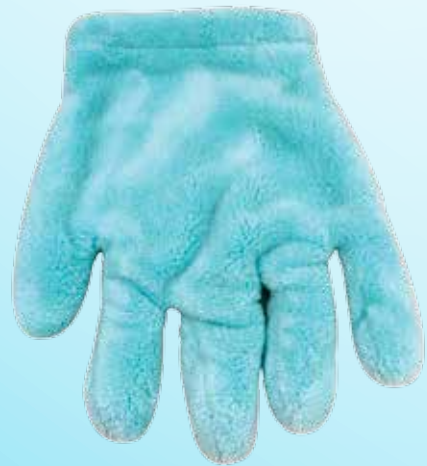
Hair drying glove