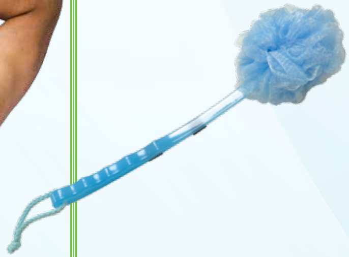
Long-handled back scrub