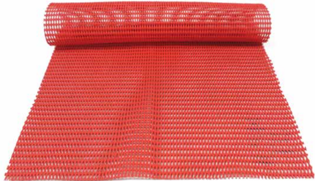
Anti-slip mat (for dry floor)