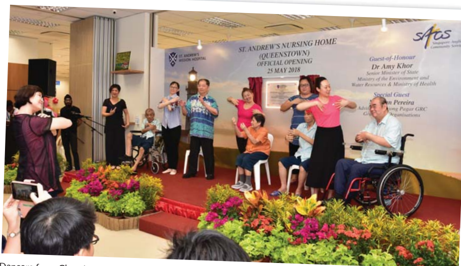
Dancers from Church of Our Saviour and Meiling Street Dance Friends performing with SANH (Queenstown)'s residents and SASC (Queenstown)'s client.

The nursing home has been blessed with many helping hands and immense support from the community groups in the neighbouring constituencies, churches and schools. Since the establishment of SANH (Queenstown) and its co-located senior care centre - SASC (Queenstown), neighbours have been actively volunteering their time to engage the seniors through organising activities and events. Contributing back to the community, SANH (Queenstown)