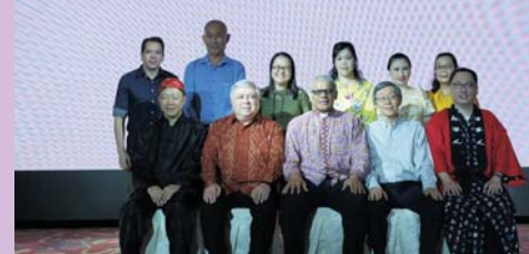
Long service award recipients of St. Andrew's Community Hospital with members of SACS and SAMH Board and Management.