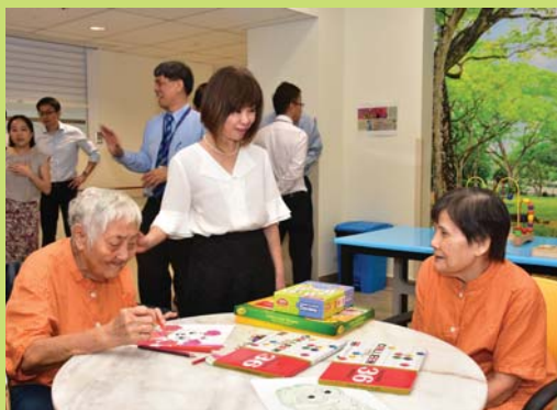
Dr. Amy Khor interacting with the residents during the SANH (Queenstown) tour.