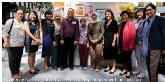
President Halimah Yacob, together with representatives from AIC, NAC as well as staff and residents of SANH (Buangkok).