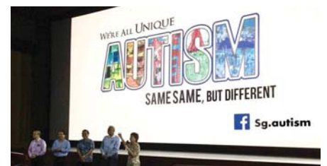
Representatives of ANS member partners welcoming invited guests and public to the special movie preview of "Tomorrow is Another Day" on 9 April 2018.

All in all, WAA(S) 2018 sparked a new beginning in its public outreach through social media and the arts, including a short clip "Buddy" and the critically acclaimed production of "The Curious Incident of the Dog in the Nighttime" jointly presented by the Singapore Repertory Theatre and Esplande -Theatres on the Bay.