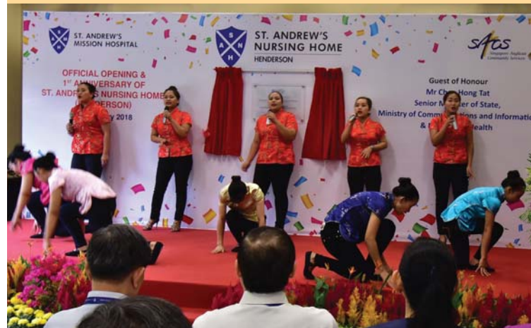
Conveying their call to care for the sick, SANH (Henderson) nursing staff sang and danced to the song, "Heal the World".

engage with the nursing home residents. This has worked well at SANH (Henderson) where neighbours of all ages have stepped forward to support and contribute to the residents' well-being.