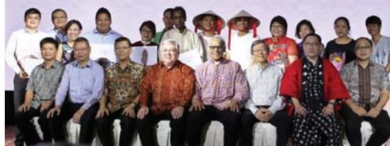
Long service award recipients of SACS with members of SACS and SAMH Board and Management.