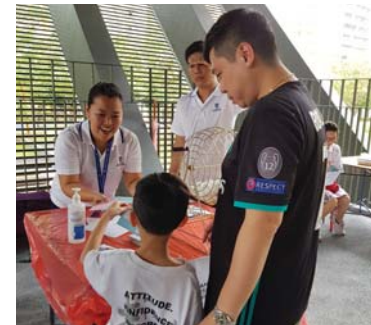
Hand hygiene games were conducted to raise residents' awareness of the importance of hand hygiene.