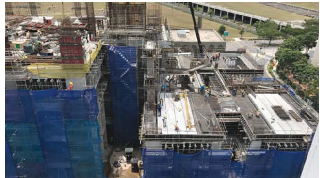
Construction of SAAH (Sengkang) is on schedule and the home is expected to be operational by April 2019.

The Adult Disability Home (ADH) that St. Andrew's Autism Centre (SAAC) is co-developing with the Ministry of Social and Family Development (MSF) began construction on 21 February 2017. The ADH will be known as St. Andrew's Adult Home (SAAH) (Sengkang). A Day Activity Centre (DAC) for up to 50 clients will be co-located with the home, which will have the capacity to house 200 residents. As of 19 April 2018, the 10th floor for one wing and the 7th floor for the other wing have been completed. Work on fittings and equipment, programme, staffing and logistics to support the residential home was on schedule. The new home is slated to receive residents in April 2019.