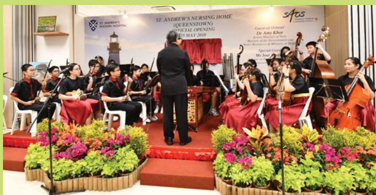
The official opening ceremony began with Queenstown Primary School's Chinese Orchestra performing three classic oriental pieces.