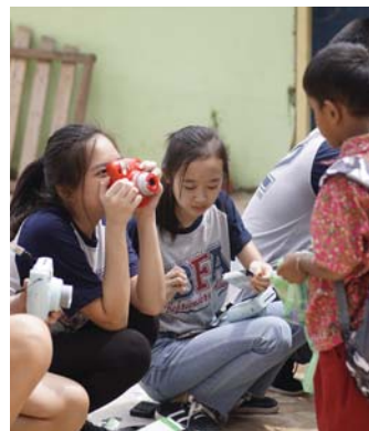
The youths capturing precious memories with children living in the slums.