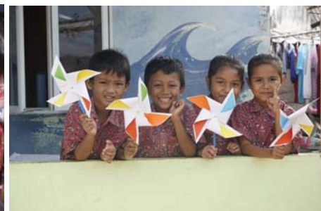
Happy children with the paper windmill they created with the help of the youths.