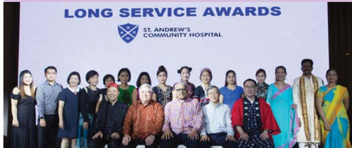
Long service award recipients of St. Andrew's Community Hospital (10 years and above) with members of SACS and SAMH Board and Management.