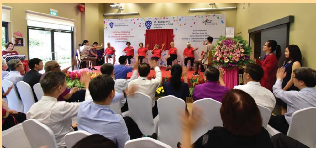
One of the highlights was the Activities of Daily Living (ADL) dance by residents of SANH (Henderson) and clients of SASC (Henderson). Guests were inspired to join in the fun of mimicking day-to-day activities such as grooming, cooking and cleaning.