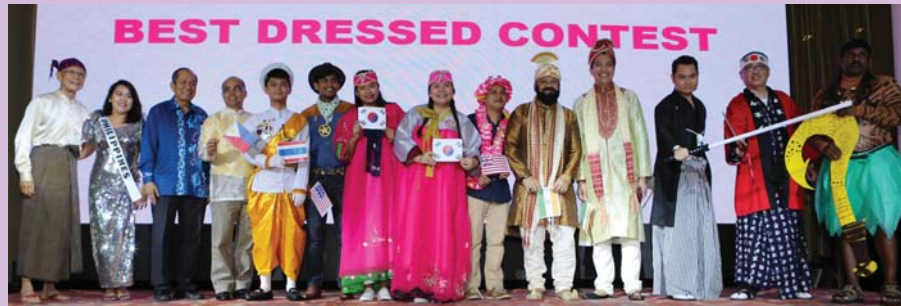
Our best dressed contestants in their beautiful national costumes.