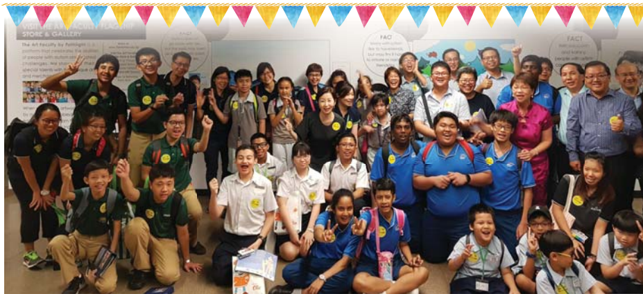
Students, clients and beneficiaries of ANS member partners coming together with big smiles to greet commuters at Bugis MRT station on 12 April 2018.

Every April signals the time to refocus on raising autism awareness in the community.