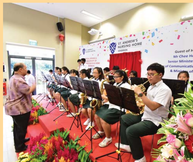
The official opening kicked off with a festive piece performed by the Christ Church Secondary School band.