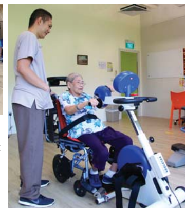
A client of Anglican Senior Centre (Hillview) undergoing rehabilitation.