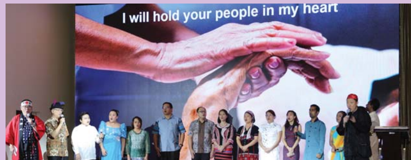
Management and staff from the various services of SACS and SAMH singing "Here I Am, Lord" together.