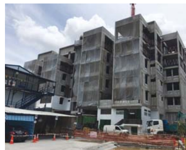
Construction of St. Andrew's Nursing Home (Taman Jurong).

SACS will also start operating a 290-bed nursing home at Taman Jurong from February 2019.