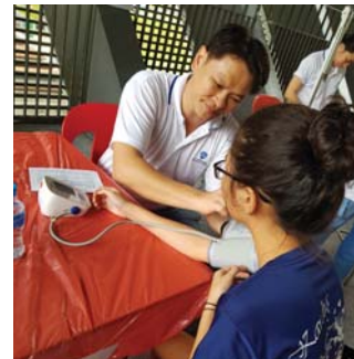
SANH (Queenstown) staff conducted blood pressure screening for residents.