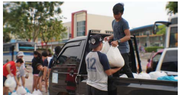
Working together tirelessly to unload the food and gift items prepared for the children in the slums.