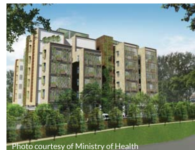
Artist's Impression of St. Andrew's Nursing Home (Taman Jurong).