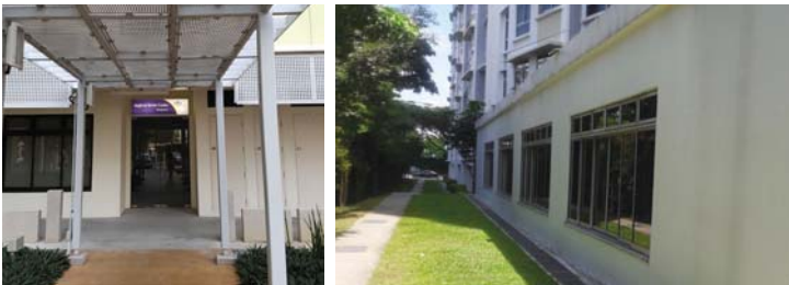
SACS widened its reach to care for Singapore's ageing population by operating 2 additional Senior Activity Centres (Studio Apartment) at Tampines and Woodlands in 2018.

ANGELICAN SERVICES ENGAGING THE COMMUNITY