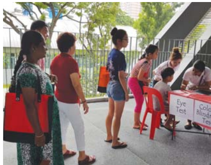
Residents queued up for basic eyesight tests.