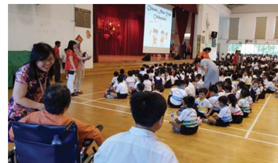
Students from New Town Primary School lifted the spirits of the residents through their bonding, singing and dancing sessions with them.