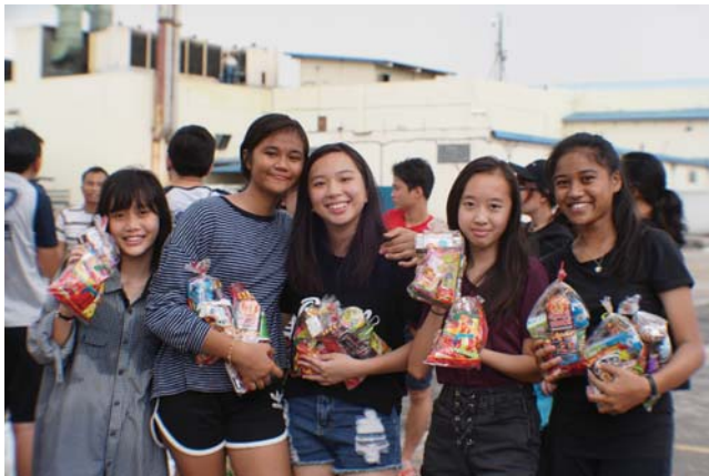
The youths gave out snacks that were meticulously chosen with love for the children living in the slums.