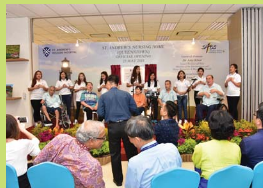
Heartwarming performances of nostalgic songs like “The Moon Represents My Heart” by the nursing team, residents of SANH (Queenstown) and a client of SASC (Queenstown).