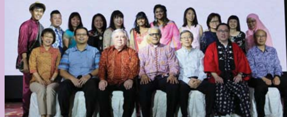
Long service award recipients of St. Andrew's Autism Centre with members of SACS and SAMH Board and Management.