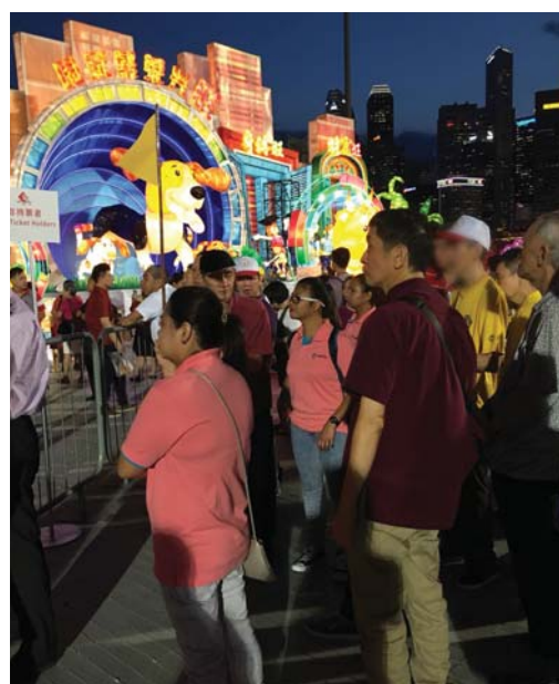
Residents and staff of St. Andrew's Nursing Home (Buangkok) immersed in the festive celebration.

As part of St. Andrew's Nursing Home (Buangkok)'s effort to encourage social interactions among residents and to enable our residents to enjoy festive celebrations, our staff brought 10 residents to River Hongbao at Marina Bay Platform Float on 22 February 2018. Despite their initial apprehension, our residents conquered their fear of crowds quickly and enjoyed the outing. Everyone was immersed in the celebratory mood and splendid decorations, with a display of 500 lanterns and beautiful fireworks. The night also brought back happy childhood memories for our residents as they visited stalls selling nostalgic food and an indoor exhibition which displayed life-sized models of a kampong house, an old Housing Board flat and a modern home dining area.