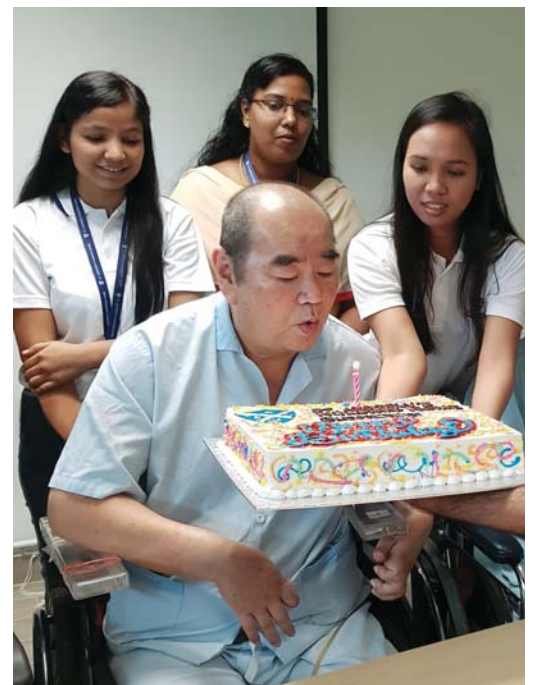
Staff and residents who were born in the month of April celebrating SANH (Queenstown)'s first anniversary and their special day.