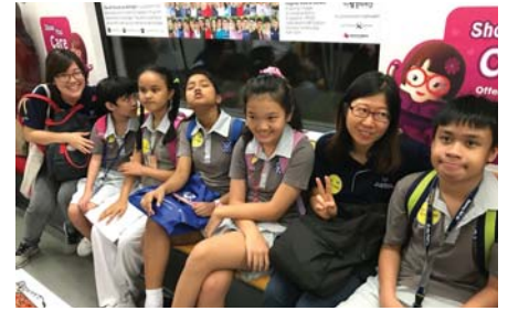
SAAC students riding the maiden voyage of the autism-themed train at its launch from Bukit Panjang to Bugis MRT station on 12 April 2018.

Nominated for four awards in the 37th Hong Kong Film Awards and bagging two, the movie realistically depicted a middle-aged mother's daily struggles of navigating through life and