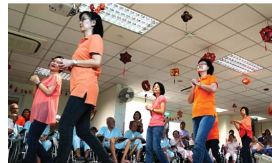
Volunteers from Evergreen Ministry of the Church of Our Saviour performing a song and dance item for the residents.

SANH (Queenstown) welcomes individuals and groups who can bring joy and hope to our beneficiaries and gain personal satisfaction through volunteering. You can make a difference in the lives of the residents with your gifts and talents. For more information on volunteer opportunities in SANH (Queenstown), please contact SANH (Queenstown) at 6877 4677 or email qnhenquiries@sanh.org.sg .