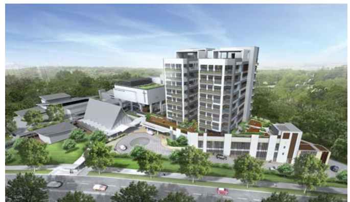
Artist's impression of St. John's - St. Margaret's Village.

When it is fully operational in 2021, SJSM Village will be an integrated provider of childcare and infant care as well as medical, nursing, respite and home-based care for seniors. The complex will feature spaces and programmes that facilitate and nurture intergenerational connectivity and activities, with the aim of improving the quality of life for both seniors and pre-schoolers.