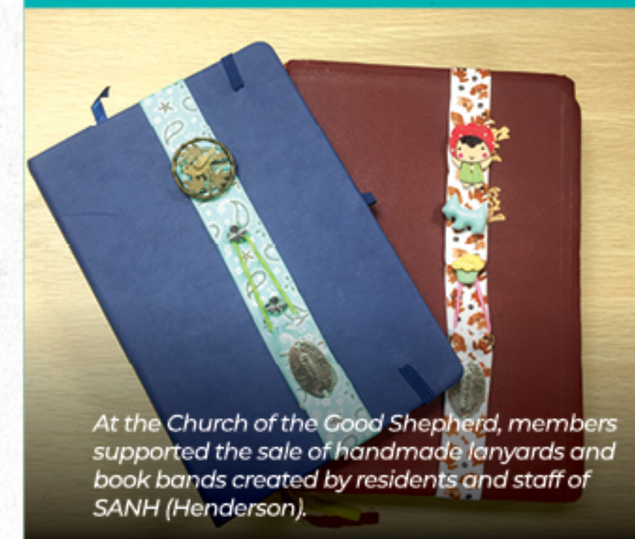
At the Church of the Good Shepherd, members supported the sale of handmade lanyards and book bands created by residents and staff of SANH (Henderson).

The resounding success was indeed an encouragement to the seniors, as well as an inspiration for our care teams and the community!