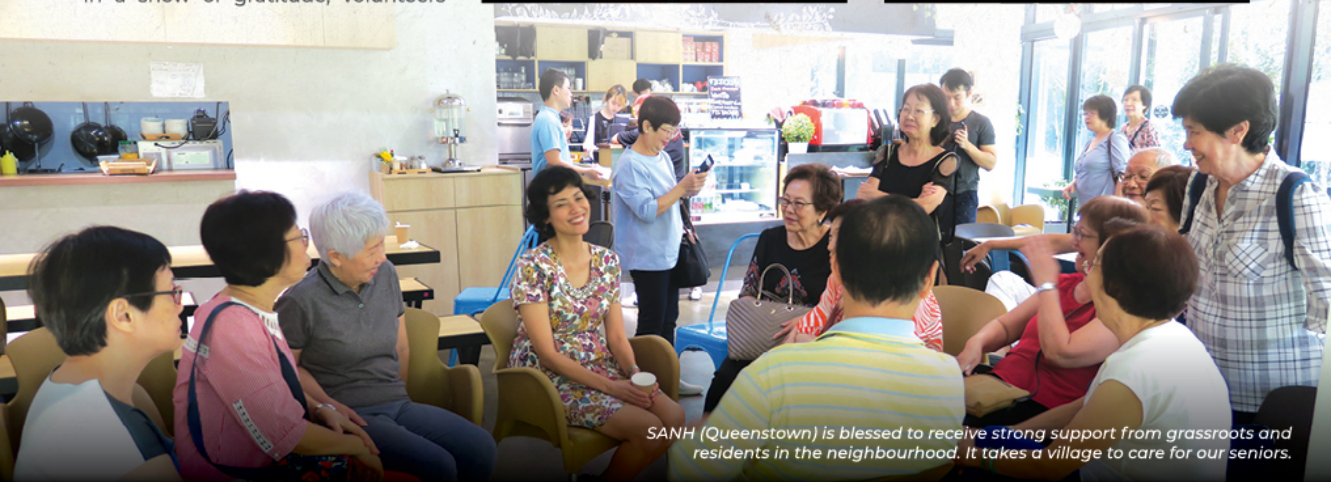
SANH (Queenstown) is blessed to receive strong support from grassroots and residents in the neighbourhood. It takes a village to care for our seniors.