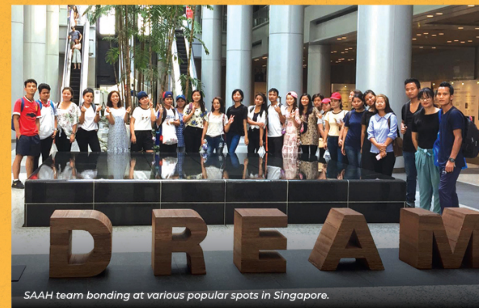
SAAH team bonding at various popular spots in Singapore.

St. Andrew's Autism Centre (SAAC) officially received the St. Andrew's Adult Home (Sengkang) [SAAH] building from the Ministry of Social and Family Development on Wednesday, 16 January 2019. St. Andrew's Adult Autism Services and SAAH staff moved in on the same day.