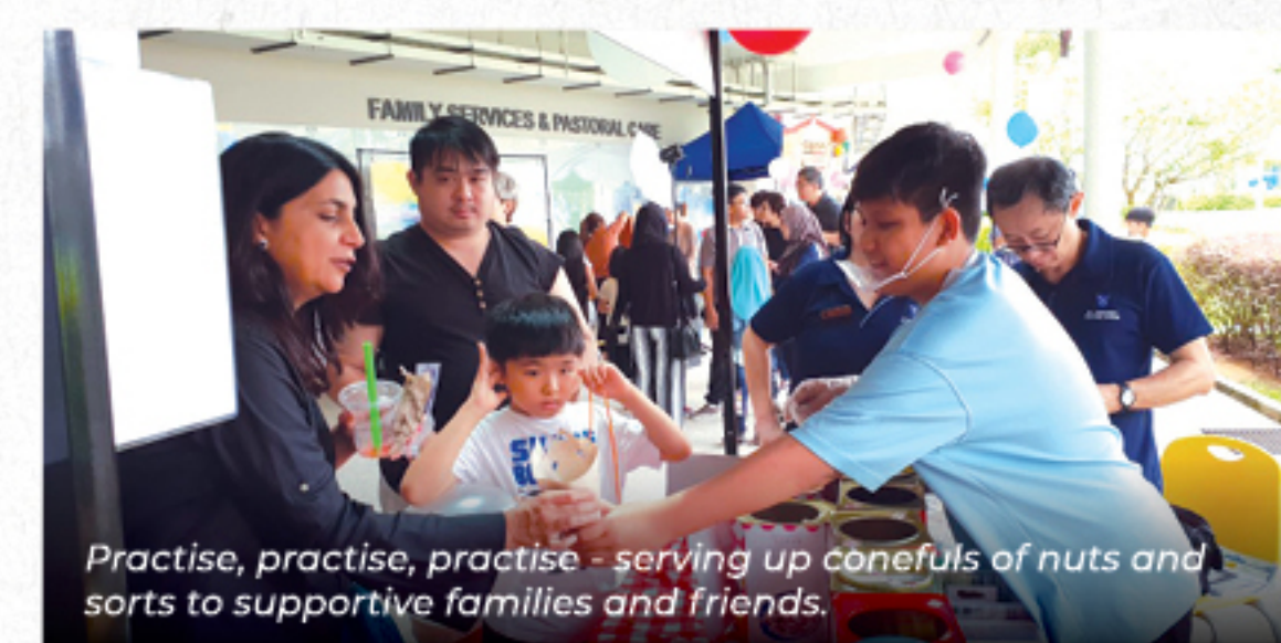
Practise, practise, practise - serving up cone-fuls of nuts and sorts to supportive families and friends.