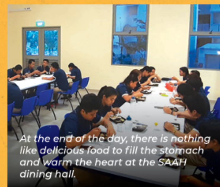
At the end of the day, there is nothing like delicious food to fill the stomach and warm the heart at the SAAH dining hall.

On 22 January 2019, SAAC management and other key staff welcomed 22 Healthcare Assistants and four Nursing Aides who had arrived from various parts of northeast India the day before. Along with Staff Nurses, these Healthcare Assistants and Nursing Aides would form the first batch of frontline staff caring for SAAH's residents, also known as SAAH care staff for short.