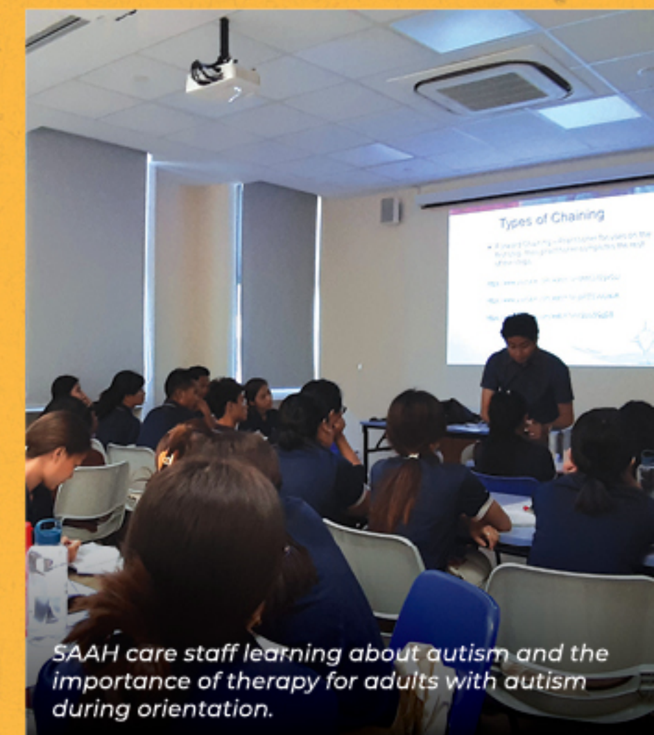
SAAH care staff learning about autism and the importance of therapy for adults with autism during orientation.

Daily Living, Communal Living Skills and Mental Health and Behaviours, with planned activities in daily routines and time-table scheduled with these objectives in mind. Day Activity Centre (Sengkang), located at SAAH, began its programme on 1 April, with 25 clients and 10 coaches moving over from DAC (Siglap).