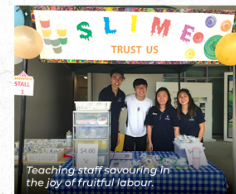
Teaching staff savouring in the joy of fruitful labour.

Last November's honours and family day for St. Andrew's Autism School (SAAS) was particularly special. It was the first time that classes of students and teachers worked hand in glove to creatively develop marketable ideas and showcase students' work at the first ever SAAS Entrepreneur Day 2018 that was attended by guests, family and friends, and teaching staff.