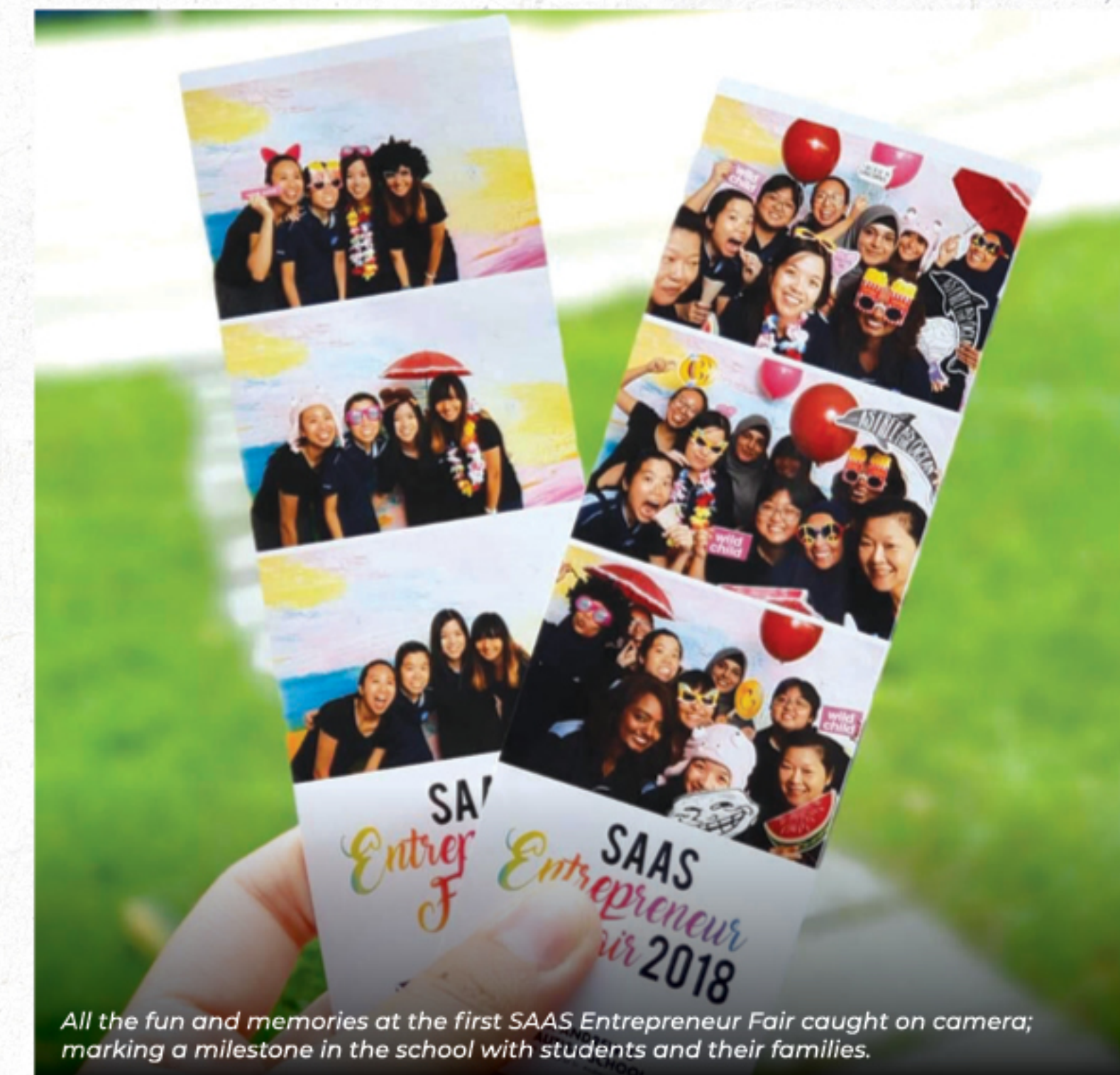
All the fun and memories at the first SAAS Entrepreneur Fair caught on camera; marking a milestone in the school with students and their families.

Overall, this event was well-received and a success. Ministry of Education guests from the Special Education Branch, and visitors alike were very impressed with the event concept, layout and participation by students, especially the inclusion of students communicating with their AAC (Assistive and Alternative