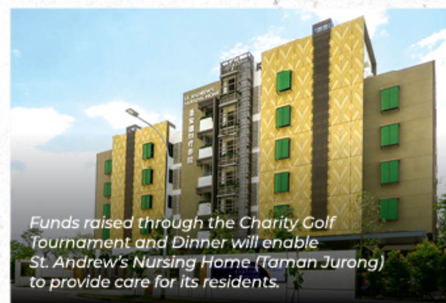
Funds raised through the Charity Golf Tournament and Dinner will enable St. Andrew's Nursing Home (Taman Jurong) to provide care for its residents.