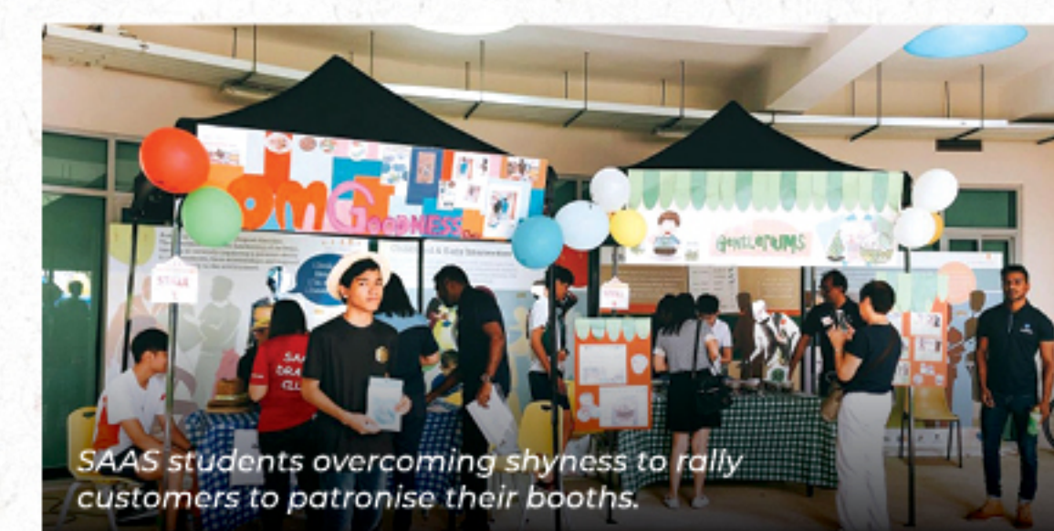
SAAS students overcoming shyness to rally customers to patronise their booths.