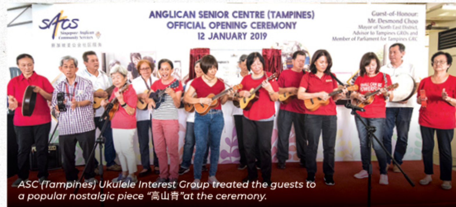
ASC (Tampines) Ukulele Interest Group treated the guests to a popular nostalgic piece "高山青" at the ceremony.

To promote graceful ageing, ASC (Tampines) serves as a social and recreational hub for the elderly to come together, develop their social network and discover the joy of pursuing their interests with fellow peers. At the centre, clients are engaged in activities that promote their well-being, such as physical exercises, haircut sessions, as well as ukulele and dance classes. At the event, guests