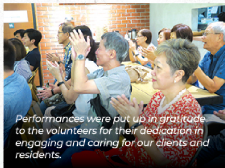
Performances were put up in gratitude to the volunteers for their dedication in engaging and caring for our clients and residents.