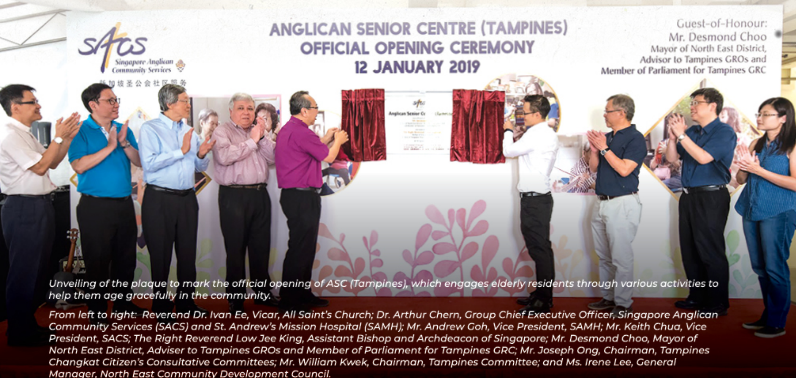
Unveiling of the plaque to mark the official opening of ASC (Tampines), which engages elderly residents through various activities to help them age gracefully in the community.