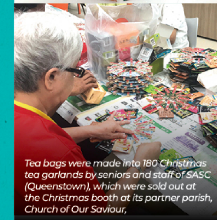
Tea bags were made into 180 Christmas tea garlands by seniors and staff of SASC (Queenstown), which were sold out at the Christmas booth at its partner parish, Church of Our Saviour,