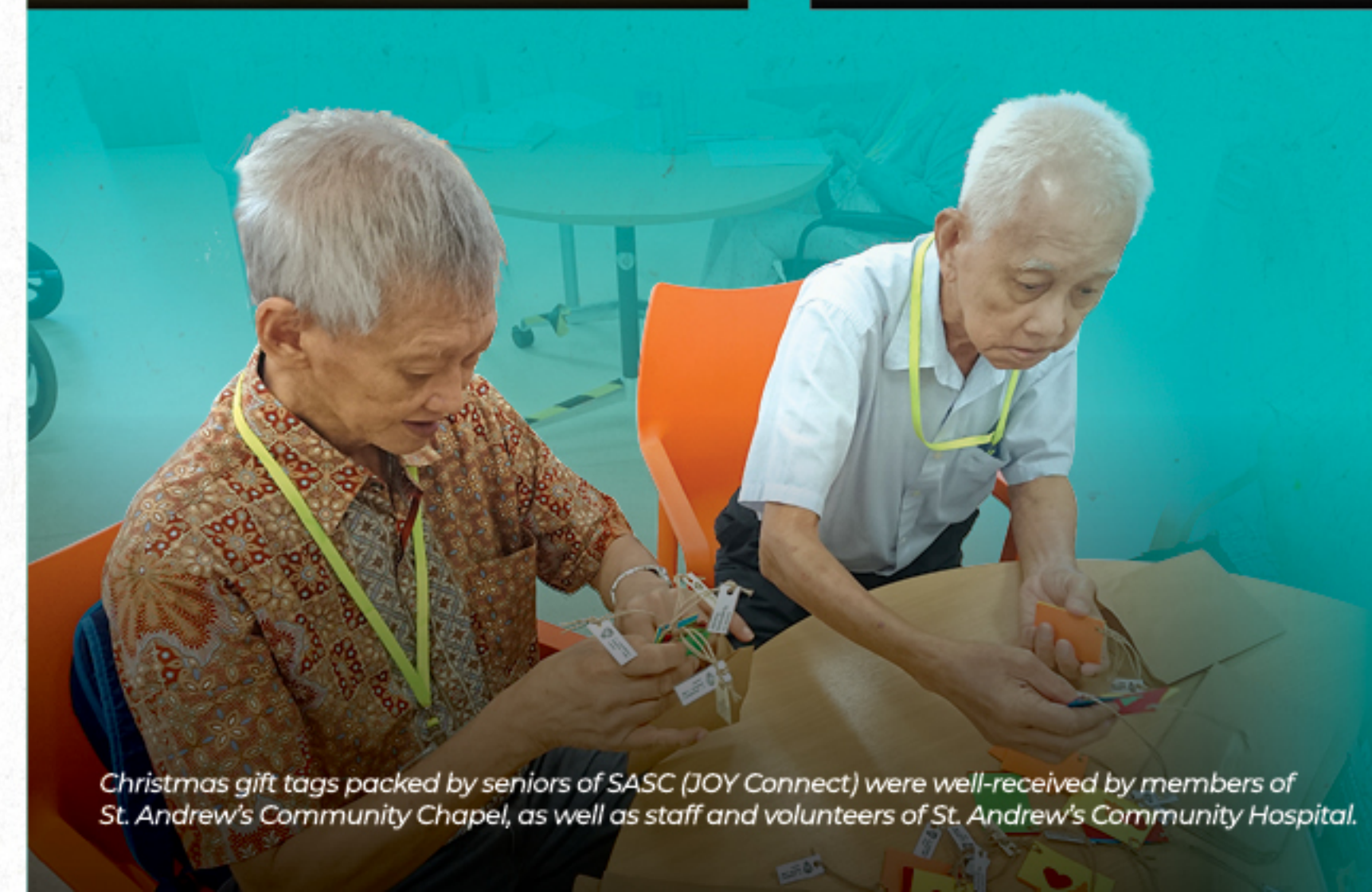
Christmas gift tags packed by seniors of SASC (JOY Connect) were well-received by members of St. Andrew's Community Chapel, as well as staff and volunteers of St. Andrew's Community Hospital.